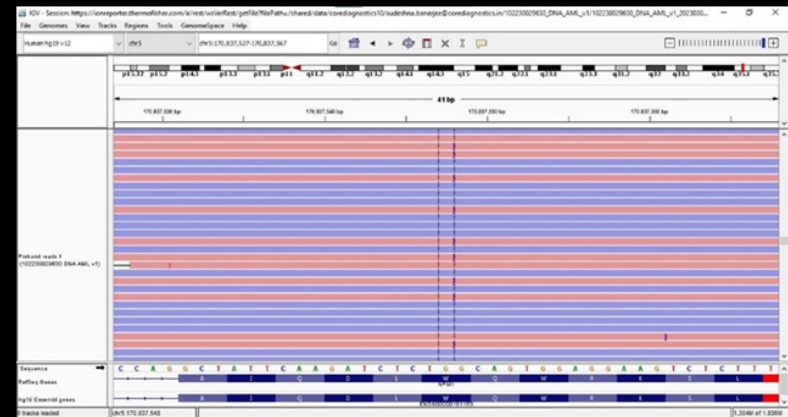
Figure 4: NPM1 (11) p.W288Cfs*12 pathogenic mutation.